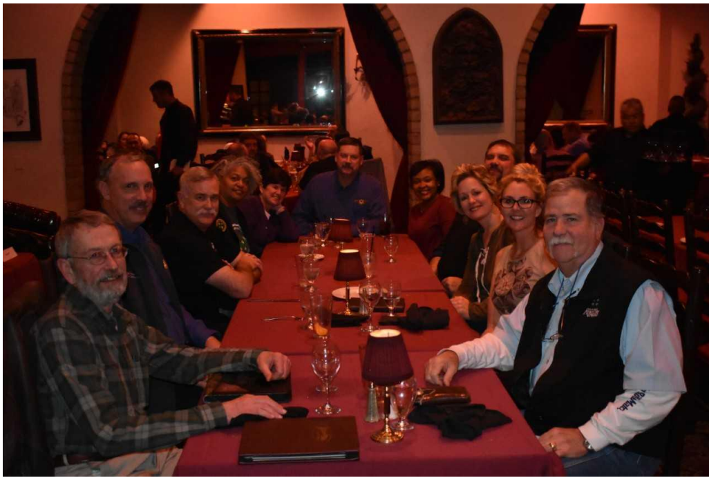
NATIONAL 4-H SHOOTING SPORTS COMMITTEE – JANUARY 2019